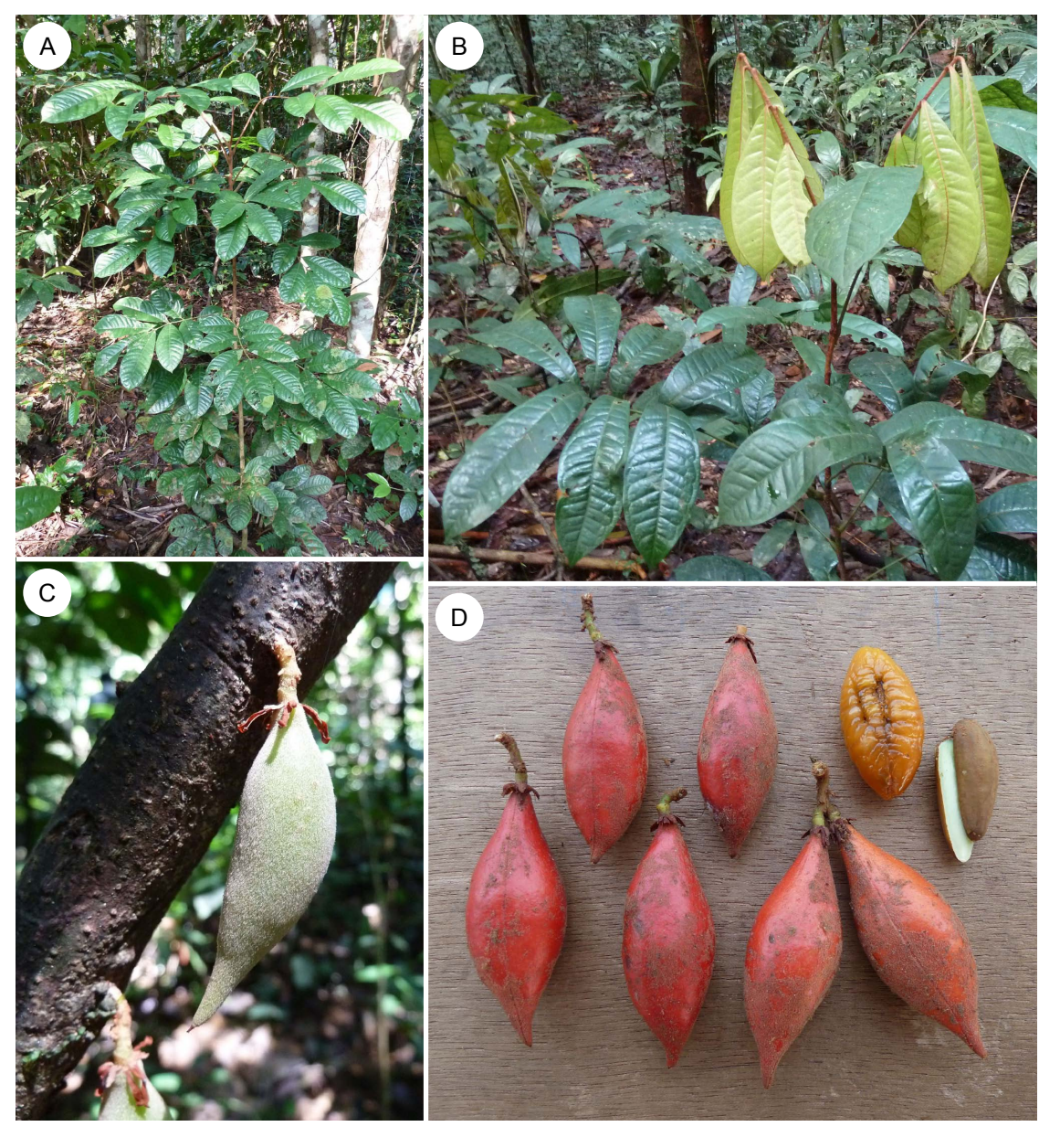
Figure 2 – Jollydora armandui: A, young plant; B, young leaves; C, young fruit; D, fruits, seed with yellow fleshy seed-coat and cleaned and split seed showing the two cotyledons.