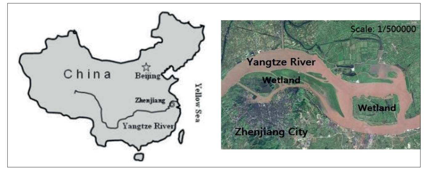
Figure 1 – Location of Zhenjiang and the Zhenjiang Waterfront Wetland in China.

In the present study, each quadrat was regarded as a synthetic resource station that included multi-dimension resources, and the number of quadrats was that of resource gradients (Colwell & Futuyma 1971, Hu et al. 2006). The niche