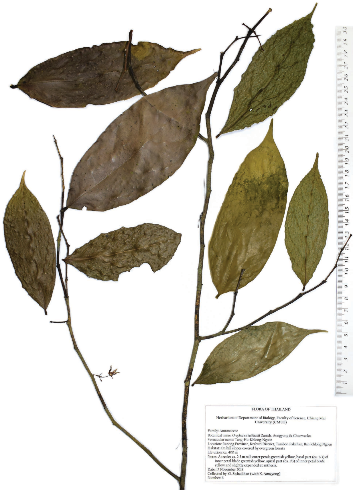
Figure 1 – Holotype of Orophea sichaikhani at CMUB (Sichaikhan 6).