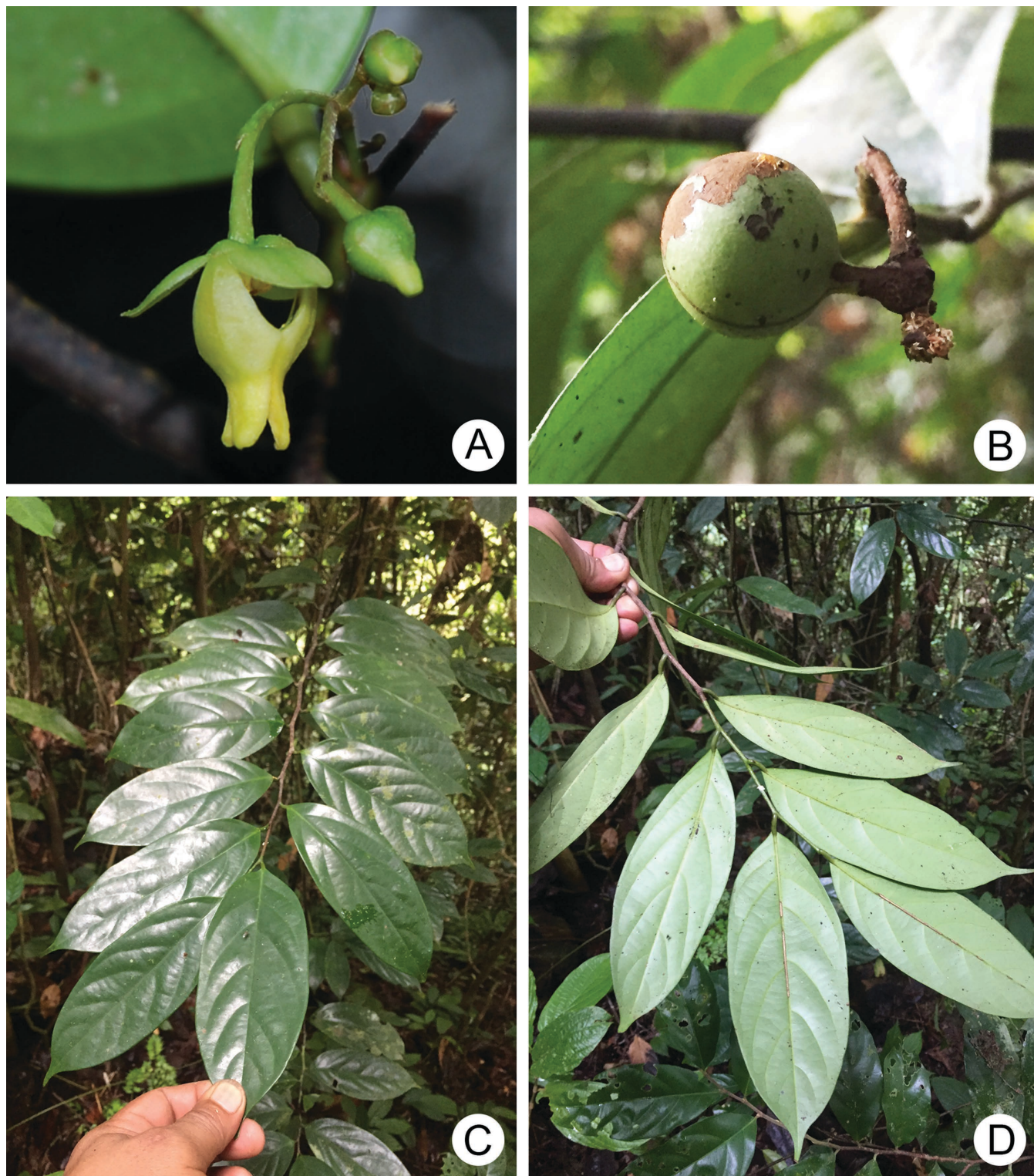
Figure 2 – Orophea sichaikhani . A. Inflorescence and flowers. B. Infructescence and globose monocarp. C. Twig, showing upper leaf surface. D. Twig, showing lower leaf surface.

forest area, particularly for plantations, happens nearly every single day (Geerawit Sichaikhan pers. comm.). On the basis of this information, we assess the species as critically endangered based on IUCN (2012) criterion “CR B2ab(iii)”. The flowering material was collected in November, whereas