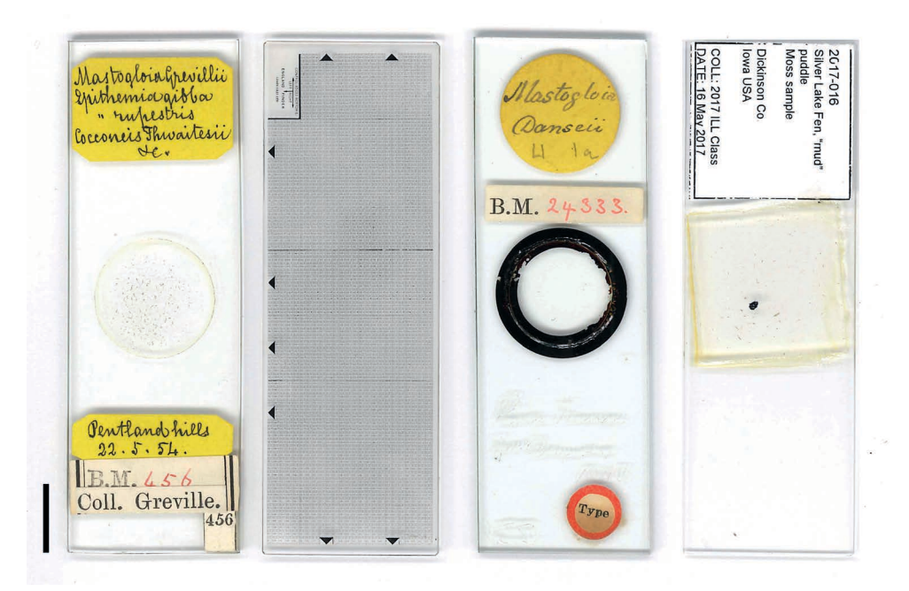
Figure 1 – From left to right, type slide of Mastogloia grevillei (BM 456), orientation of England Finder slide used to mark lectotypes, type slide of Dickieia danseyi (BM 24333), and slide examined from Silver Lake Fen, Dickinson Co., Iowa (Lakeside Reimer Diatom Herbarium ILL-2017-016). Scale bar = 1 cm.

Moss epiphytes were collected at the base of a large peat mound locally known as Silver Lake Fen in Dickinson Co., Iowa, USA (Sample ILL-2017-016, 16 May 2017, 43.437813°N, 95.366731°W, slides and material deposited in the Iowa Lakeside Reimer Diatom Herbarium). Silver Lake Fen is a perched alkaline fen that has long been a collecting locality for the diatom, algae, and aquatic ecology classes at Iowa Lakeside Laboratory (Lannoo 1996). Samples were prepared for microscopical analysis using 30% H<sub>2</sub>O<sub>2</sub> and concentrated nitric acid following Stoermer et al. (1995). Cleaned material was mounted on microslides with Zrax (MicrAP, Philadelphia, Pennsylvania) and examined on a Leica DM LB2 using differential interference contrast (DIC) and full oil immersion Plan Apo 100X NA 1.4 optics (Nikon, Tokyo, Japan). Images were gathered with a MicroPublisher 3.3 RTV system running QCapturePro (QImaging, Surrey, British Columbia) software and post-processed using Photoshop CC 2018 (Adobe, San Jose, California). For population estimates, diatom relative abundance was based on enumera-