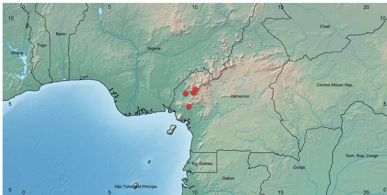
Figure 2 – Tricalysia elmar global distribution (marked in red).

The floral disc in Rubiaceae e.g. in Tricalysia , is considered to secrete nectar for the attraction of pollinators (Robbrecht 1987: 53). Therefore, it is not unexpected that as the ovary develops into the fruit, it is generally invisible or inconspicuous, concealed by the calyx, having no obvious function at that stage. However, several species of Rubiaceae in a range of genera and tribes are distinguished from their congeners at the fruiting stage by the presence of accrescent discs which are highly conspicuous to the naked eye, occupying much of the apex of the fruit. Elsewhere in the Coffeae this feature can be seen in Coffea bakossii Cheek & Bridson where it helps to distinguish it from the similar C. liberica Hiern (Cheek et al. 2002a). In the Vanguerieae, massive accrescent discs are an important character for recognising Keetia susu Cheek and Keetia abouabou Cheek (Cheek et al. 2018d)